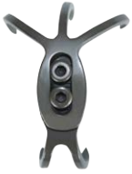
10234 Patella Claw Plate

Used for distal lateral fibular fracture with HA4.5 cortical screws and HB4.0 cancellous screws.