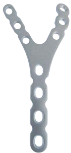
10221/20221 Distal Humeral Y-Plate II

Used for distal humeral fracture with HA3.5 cortical screws and HB4.0 cancellous screws.